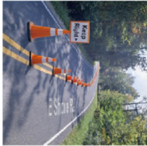
Sample curve barricades

Runners are restricted to the southbound (eastbound on Devil's Dive and Blue Water) lane on all roads north of Eastern Ave. Ideally barricades would be placed along the center line of the entire affected area. At a minimum barricades must be placed at the center line at all locations where entering the northbound lane would be create a shorter route. The entire curve must be barricaded in such instances. (see triangle symbol for required locations)